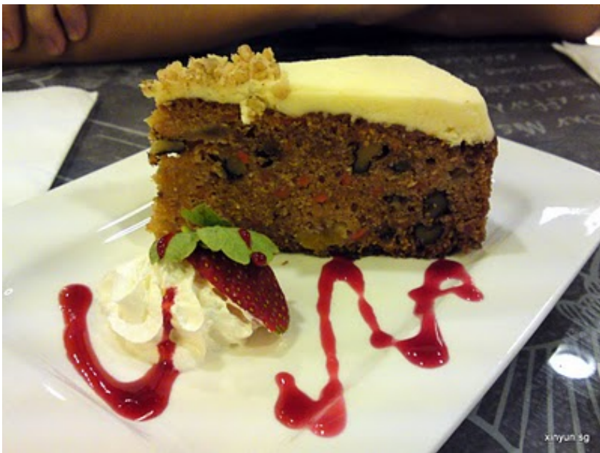
Interesting taste Carrot Cake..

Total damage for 2 set dinner with cake add-on, no more than S$40 😊 Which supposedly include a drink and soup, didn't take any (photos).