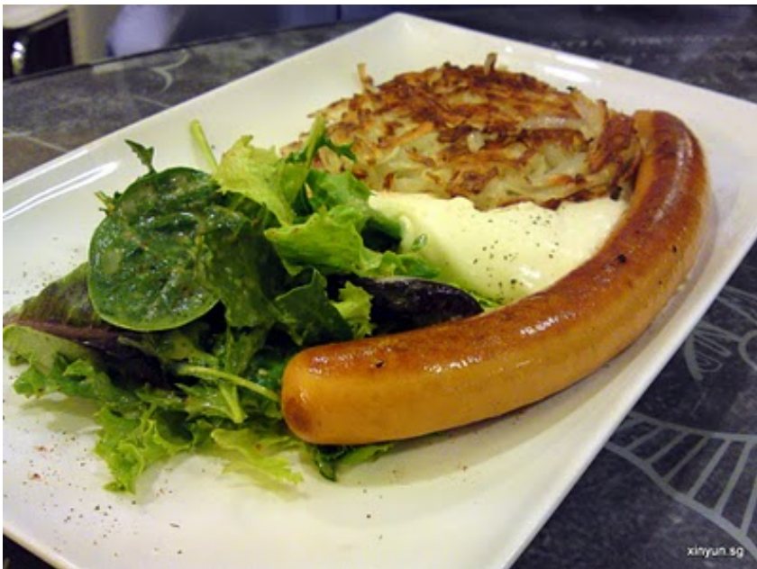
Yummy Cheesy Chicken Sausage & Rosti..

Service was great, with a smile and food recommendation... and the food... yummy 😊