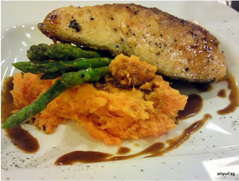
Generous portion and nicely done Pan seared Norwegian Salmon..