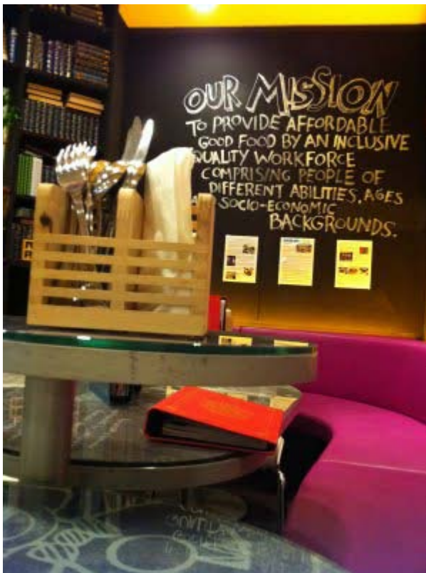
Professor Brawn Cafe's interior

Remember we take our the GSM in Yr 1 Sem 1? Yes, Social Enterprise! Today had my chance to visit of this SE. Well gotta admit that I love the spirit of social enterprising =)