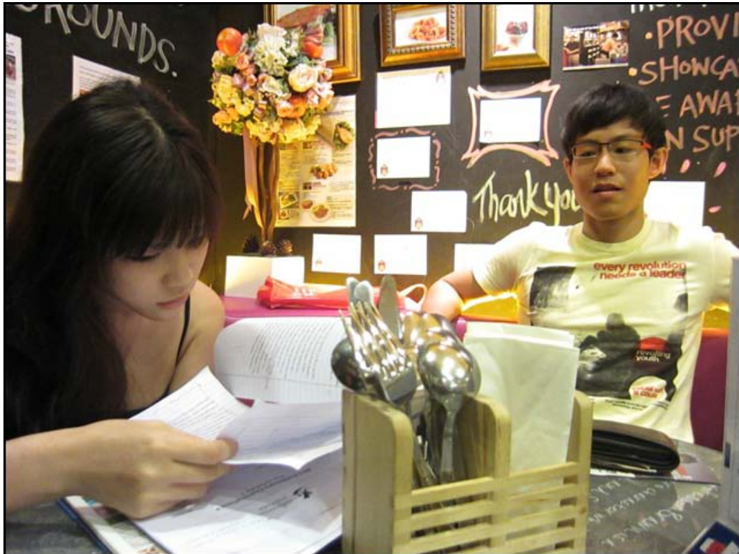
Understanding how this guy can get 21/25 for Economics --"