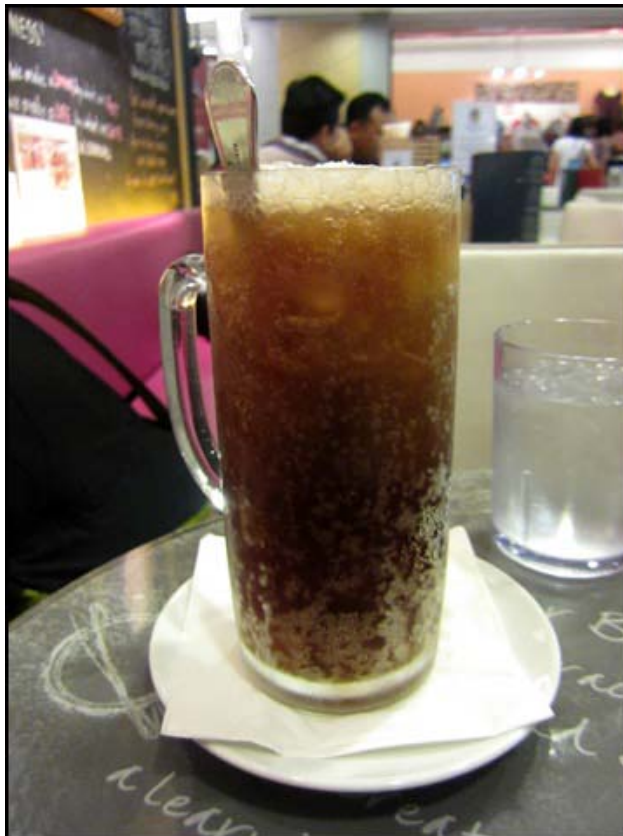
Root Beer Float!