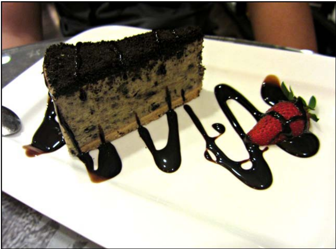
Orea Cheesecake $4.90