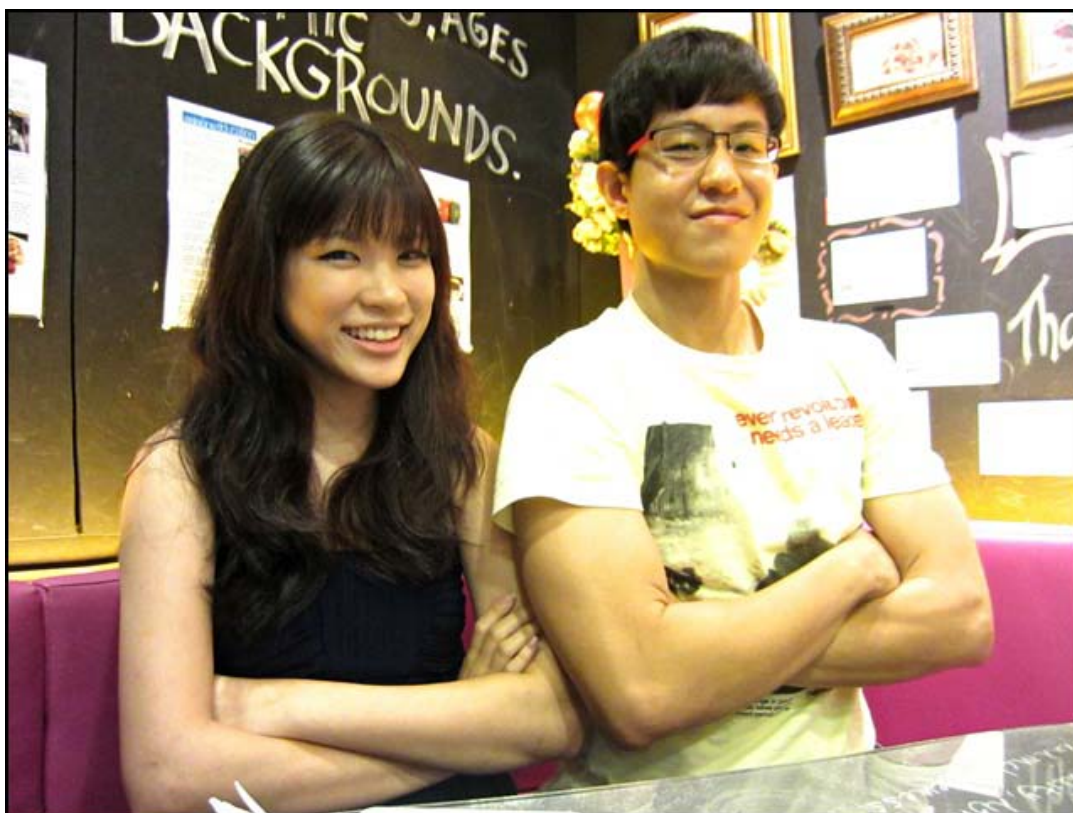
Tough like hehe

You can really see the stark difference between someone who goes to the gym and someone who doesn't even know what exercising means haha!