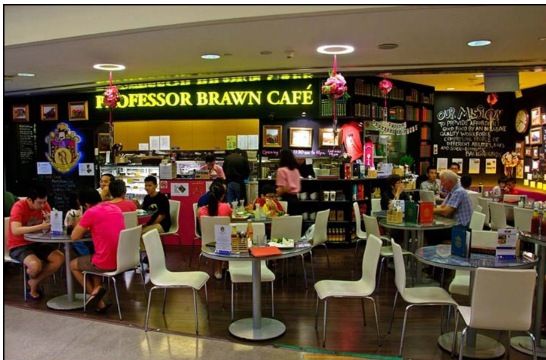
It looks like a library from a Harry Potter film haha